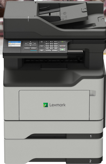
MB2338adw with optional tray