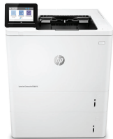
HP LaserJet Managed E60075x