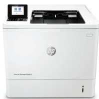
HP LaserJet Managed E60075dn

This HP LaserJet Printer with JetIntelligence combines exceptional performance and energy efficiency with professional-quality documents right when you need them—all while protecting your network from attacks with the industry's deepest security. 1