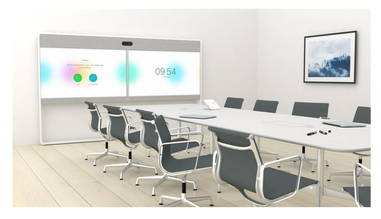
Figure 2. Cisco Spark Room 70 in large conference room