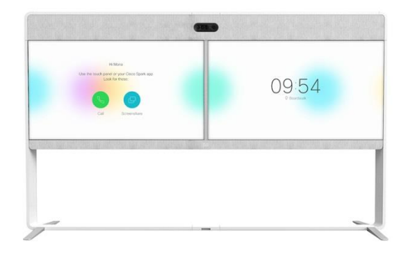
Figure 1. Cisco Spark Room 70 Dual and Cisco Spark Room 70 Single on Free-standing Floor Stand

The Room 70 – comprising a powerful codec, a quad-camera, and 70" single or dual 4K display(s) with integrated speakers and microphones – is ideal for rooms that seat up to 14 people. It offers sophisticated camera technologies that bring speaker-tracking and auto-framing capabilities to medium to large-sized rooms. The product is rich in functionality and experience but is priced and designed to be easily scalable to all of your conference rooms and spaces – whether registered on the premises or to Cisco Spark through the Cisco Collaboration Cloud.