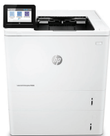
HP LaserJet Enterprise M608x