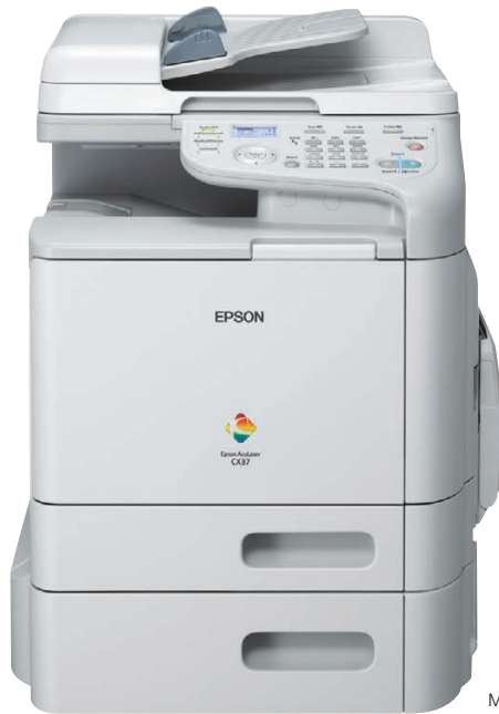
Model shown is the CX37DTNF

The Epson AcuLaser CX37DN series allows medium-to-large workgroups to print in A4 duplex, plus copy and scan in colour and mono, with fax** available on the CX37DNF and CX37DTNF models. The series also features an automatic document feeder as standard, while an optional additional paper tray allows workgroups to further improve productivity and save time by quickly and easily increasing paper capacity.