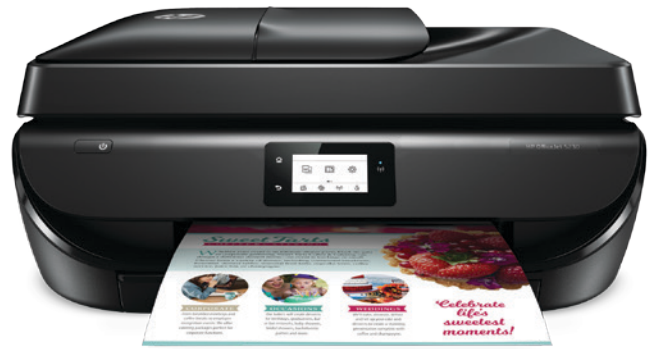
HP OfficeJet 5200 All-in-One