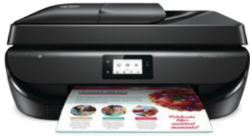
HP OfficeJet 5200 All-in-One

To order the HP OfficeJet 5200 All-in-One series and supplies, please go to hp.com . To contact HP by country, please visit hp.com/go/contact .