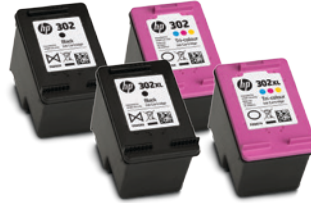
HP 302 and 302XL Original ink cartridges

1 Wireless operations are compatible with 2.4 GHz and 5.0 GHz operations only. Learn more at hp.com/go/mobileprinting . Wi-Fi® is a registered trademark of Wi-Fi Alliance®.