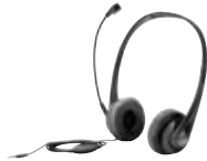
HP Stereo 3.5mm Headset