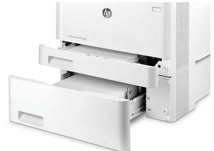
HP LaserJet Pro M452dn with optional 550-sheet tray