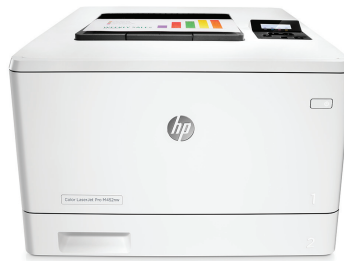
HP LaserJet Pro M452dn

Ideal printing performance and solid security for how you work. This capable colour printer finishes jobs faster and delivers comprehensive security to guard against threats. 1 Original HP Toner cartridges with JetIntelligence produce more pages. 2