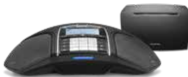
KONFTEL 300Wx IP

Teaming the Konftel 300Wx with the Konftel IP DECT 10 is one of our most popular solutions. Now it is available as a single package, delivering wireless conference calls in HD quality via your IP telephony system (SIP). Each IP DECT base can handle up to 20 registered Konftel 300Wx devices and five ongoing calls.