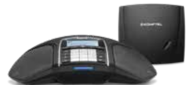
KONFTEL 300Wx ANALOG

Simple and reliable. Konftel 300Wx with Konftel DECT Base for analog connection. Simply plug the base station into the phone jack and your wireless conference solution is ready to go, with up to seven phones connected.