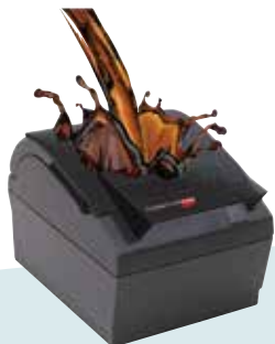
Spill Guard Option

CognitiveTPG's patented ReceiptWare marketing software transforms every receipt into a promotional opportunity. Add logos and watermarks, offer promotions, highlight sales and savings, run contests, promote your Facebook page, include your own QR Code...the options are endless!