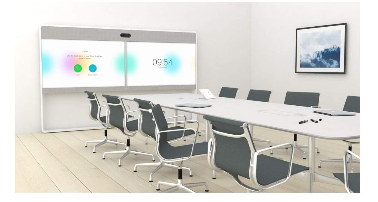
Figure 2. Cisco Spark Room 70 in large conference room