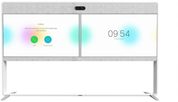
Figure 1. Cisco Spark Room 70 Dual and Cisco Spark Room 70 Single on Free-standing Floor Stand

* Integrated microphones for speaker tracking only