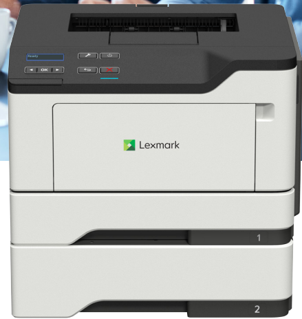
MS421dn with optional tray