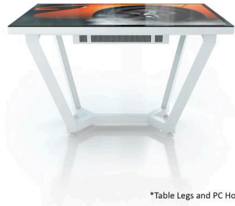
*Table Legs and PC Holder optional