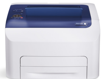
Phaser 6022. Print.