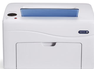
Phaser 6020. Print.