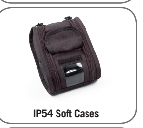
Shoulder Strap System