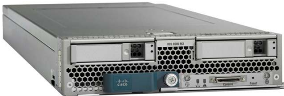
Figure 1. Cisco UCS B200 M3 Blade Server

The Cisco UCS B200 M3 Blade Server continues Cisco's commitment to delivering uniquely differentiated value, fabric integration, and ease of management that is exceptional in the marketplace. The Cisco UCS B200 M3 further extends the capabilities of Cisco UCS by delivering new levels of manageability, performance, energy efficiency, reliability, security, and I/O bandwidth for enterprise-class applications: